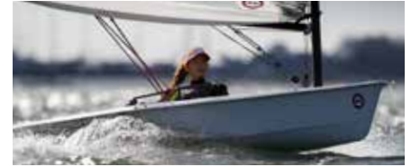
All photos in this booklet are of the v4 RS Aero prototypes.

The RS Aero is the result of three years of design and development, testing four different hull variations and numerous rig, foil and layout options.